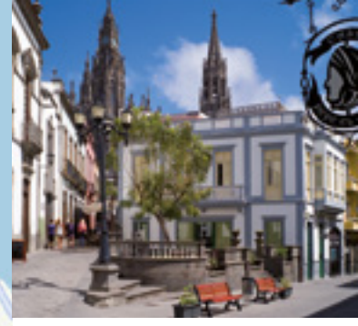
Casco Histórico de Arucas.

the Montaña de Arucas, to enjoy the splendid views down to the interior and the coast of Arucas, from the viewpoints located on high.