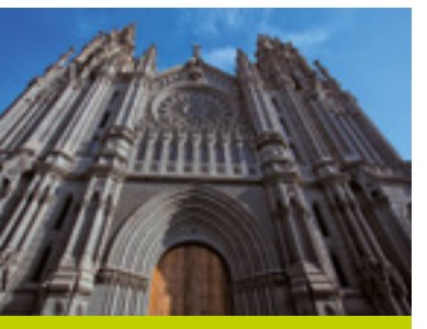
The church of san Juan Bautista.

The municipality of Arucas takes up a surface area of 33km<sup>2</sup> on the north face of Gran Canaria, and extends from the coast up to the hills to over 600 metres above sea level.