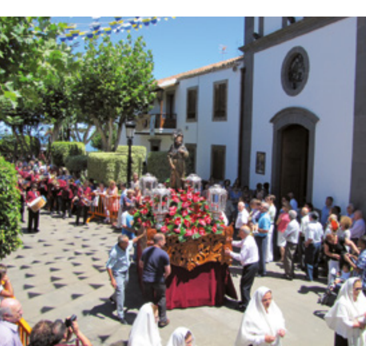
Procession of San Roque.

The main festival is the Patron Saint San Roque, which takes place on 16th August. For this, many different cultural, popular, traditional and religious acts are organized, with special mention going to the Traditional Pilgrimage of San Roque, the Livestock Fair, and the Night of Torment.