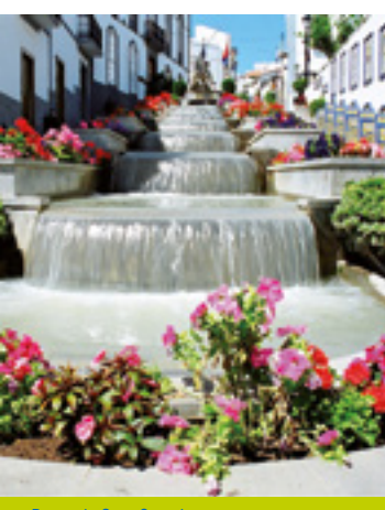
Paseo de Gran Canaria.

The town of Firgas is located to the north of the island of Gran Canaria, some 28km from the capital It has a surface area of 15.77km<sup>2</sup> and is set at an altitude of 465m above sea level.