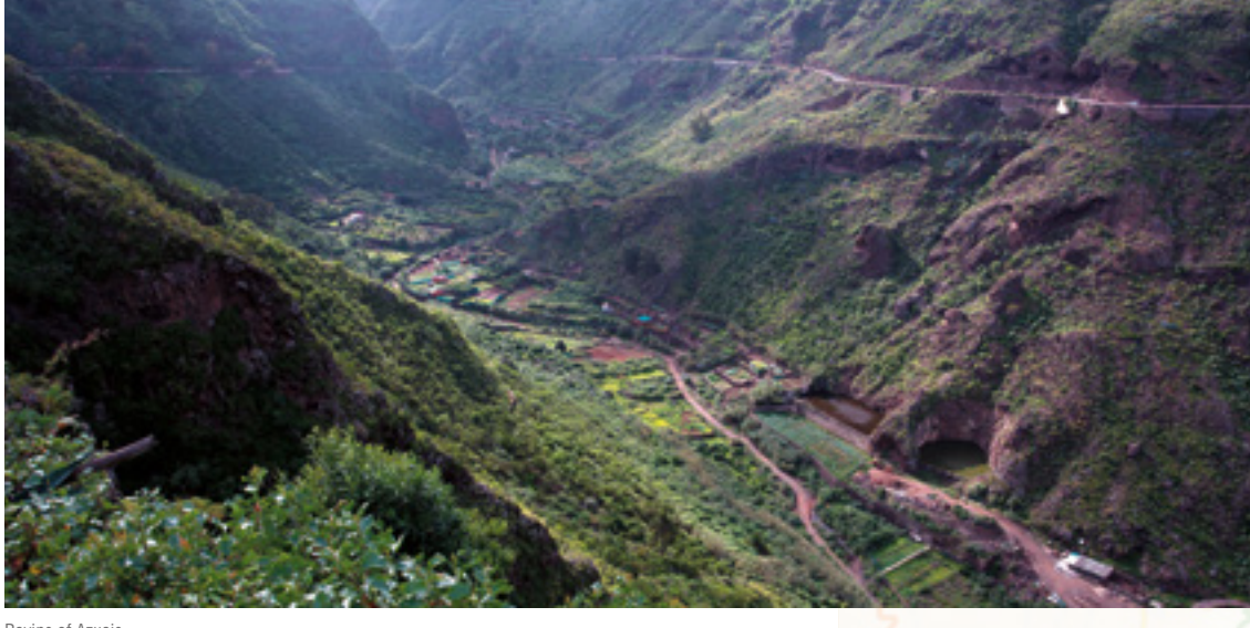
Ravine of Azuaje.

The Firgas Town Hall building is a neo-Canary style town mansion built in the 1940s. Standing out among its fine materials is the blue stonework that came from the famed stone quarries form the lower part of the municipality. and also the Canary pine wood used in the construction of its magnificent balconies. The 16th century Firgas Water Mill, declared of Cultural Value in 2007, is situated above a water