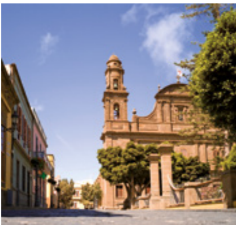
Plaza de Santiago Apóstol.