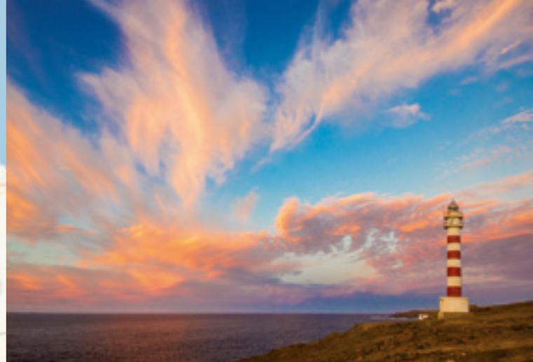
Faro de Sardina.

In its interior there is a variety of interesting imagery sculptures, paintings, ornaments and works of precious metals in diverse styles, as well as other especially unique pieces such as the Pila Verde, where practically all the pre-Hispanic population of the historic region of Gáldar were christened.