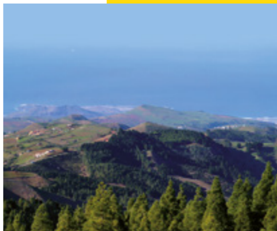
Caldera Pinos de Gáldar.