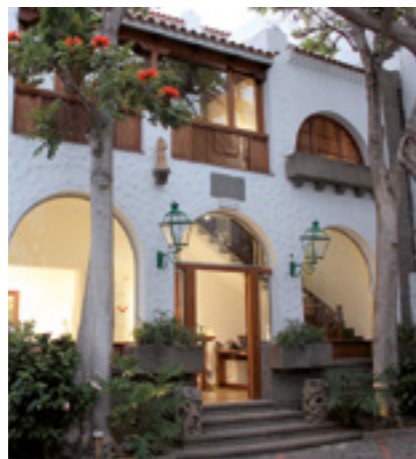
Antonio Padrón House Museum.

Right in the middle of town are the most important archaeological settlements in the Canaries, at the Museum and Archeological Park of La Cueva Pintada (Painted Cave).