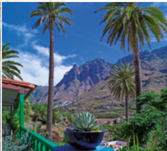
Valley of Agaete.