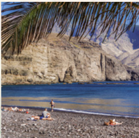
Las Nieves beach.