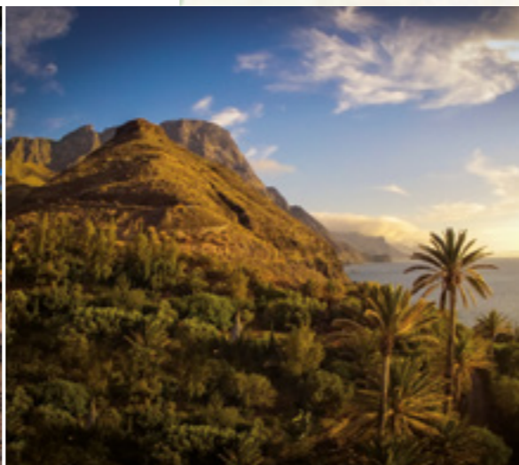
Barranco de Guayedra.

On our walk up to the Town Centre we come across the Church of the Immaculate Conception , the present-day temple dating back to 1874. Agaete is fundamentally renowned regionally, nationally and even internationally for its popular festival, the Bajada de la Rama . This fiesta is a clear reflection of the happy go lucky and partying spirit of the people from the municipal area, and is celebrated on 4 th of August each year. Its most characteristic elements can be savoured all year round at the Rama Museum , located close by, down one side of Agaete's afore-mentioned main church. Within the picturesque town centre and walking along the village's main La Concepción street, a sign-post invites us to visit the Huerto de las Flores Botanical Garden , a park that emerged in the 19 th century thanks to the efforts of the Armas family, the former owners of the land there, when they started planting seeds from all over the world, especially America, creating a tropical garden with