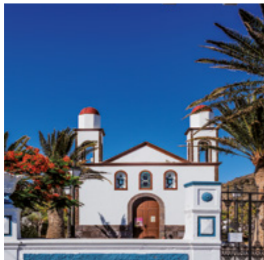
Hermitage of Our Lady of Las Nieves.

Agaete also has a rich Historical and Artistic Heritage , in which the Hermitage of Our Lady of Las Nieves