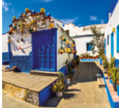
Puerto de Las Nieves.

Following on along the road leading to the Valley of Agaete, we can marvel at the beauty of its countryside, with parallel views of Tamadaba Heights with their lush pine trees. The Macizo de Tamadaba and Altavista make up one of