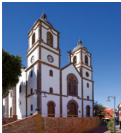
Ntra. Sra. De la Candelaria.

As we continue our route, we can go into the Néstor Álamo Park, surrounded by brightly coloured painted houses that overlook it, providing a splash of