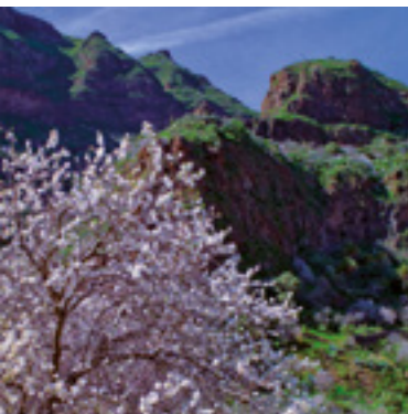
Almendros en flor.