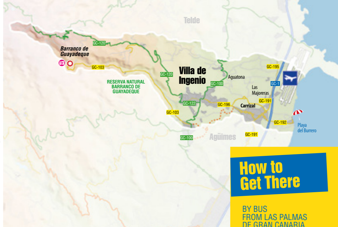
Playa del Burrero beach.