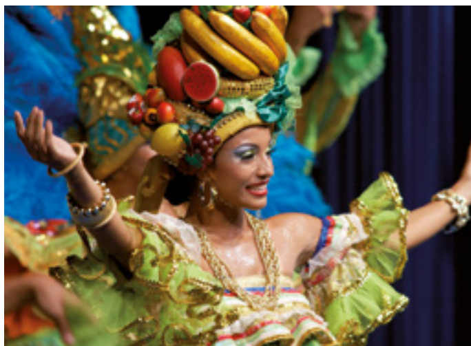
Festival Internacional de Folklore "Muestra Solidaria de los Pueblos".

Since ancient times wrestling has been especially important.