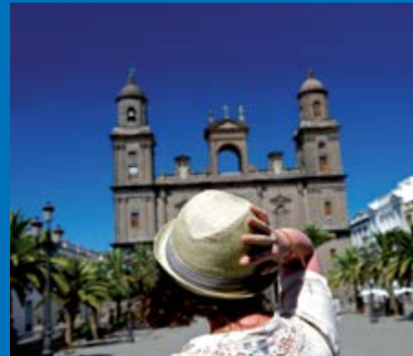
Santa Ana Cathedral

The Pueblo Canario is an ideal space to learn about everything Canarian, with typical Canary live music every Sunday, a Museum dedicated to symbolist painter Néstor Martín-Fernández de la Torre, as well as a display of local flora in Doramas Park to the back.