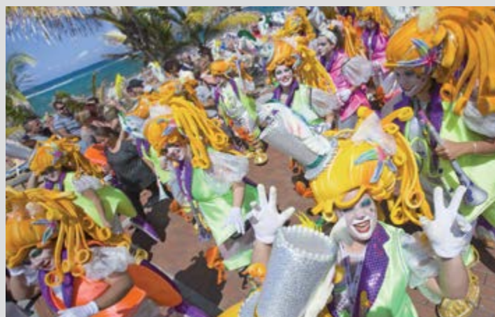
The Las Palmas de Gran Canaria carnival