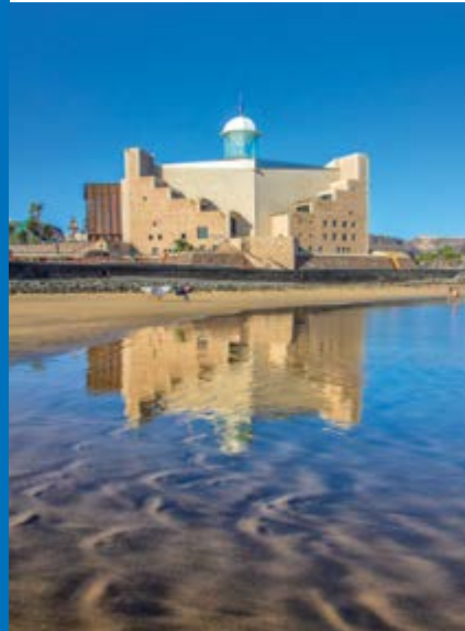
Alfred Kraus Auditorium and Congress Palace