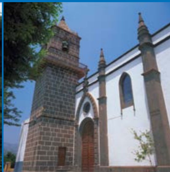
Parish Church of Santa Brígida