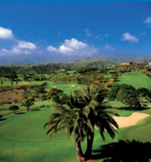
Royal Golf Club of Las Palmas