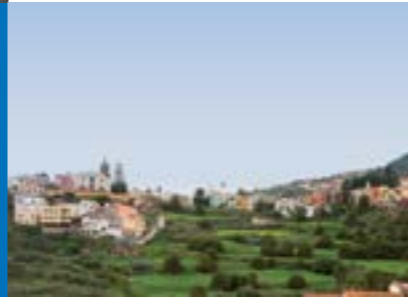
Historical Town Centre of Santa Brígida