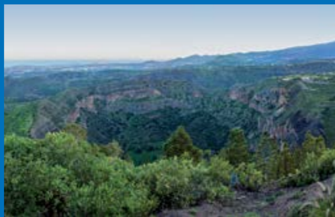
Caldera de Bandama

From La Atalaya, we move on to the main town centre of the municipality, where we firstly come to the Parish Church on our walk around. In its surrounding areas, Santa Brígida offers countryside of extraordinary beauty which are well worth a visit, as well as other places dotted around, such as the Agricultural Park of El Guinguada, the Casa-Museo del Vino museum, as well as visiting other buildings such as the Water Heritage of Satautejo and La Higuera, the Royal Casino, and the Fonda de Melián.