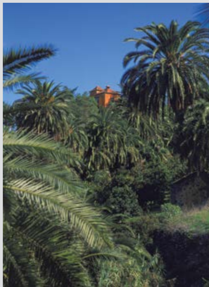
Palm grove in Santa Brígida

This is the oldest fiesta in the municipality. In the second third of the 16 th century, the founder of the town, Isabel Guerra, left in her will the celebration of a fiesta in honour of the Saint, having built the first hermitage. The pilgrimage goes back to 1957, and is celebrated on the first weekend in August with a pilgrimage of offering, in which all the districts come together with floats regaled with typical motifs and with pilgrims, magicians and musical groups.