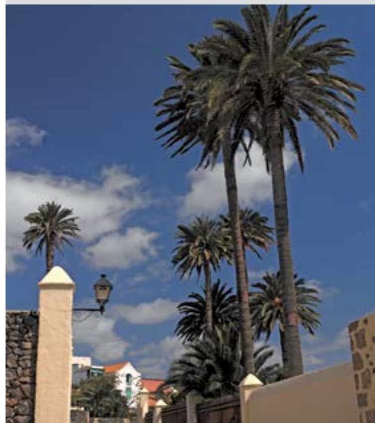
Artistic Historic District of San Francisco

Summer Come up to summer in Telde Campaign 15 th August Fiesta of La Traida del Agua (Bringing of the water) 14 th September Fiesta of Santo Cristo de Telde 8 December Fiesta of La Caña Dulce o la Concepción