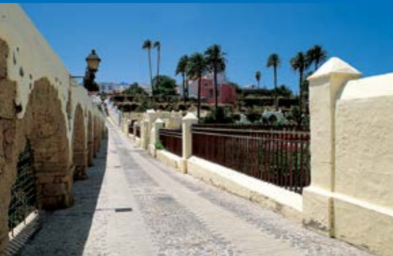
Artistic Historical District of San Francisco

To finish off our fantastic day, we can look out and see the dusk fall at the coast , while we take one last stroll along the coastal promenade, or simply take in the spectacle of the sea opposite the Bufadero de La Garita .