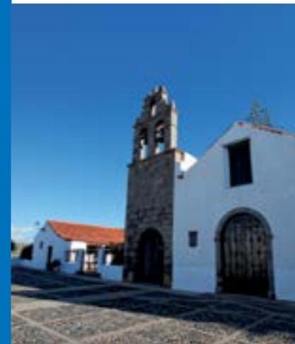
Artistic Historic District of San Francisco

Situated to the southeast of Gran Canaria, Telde is just 13 kilometres from the island's capital, Las Palmas de Gran Canaria, southwards down the motorway.