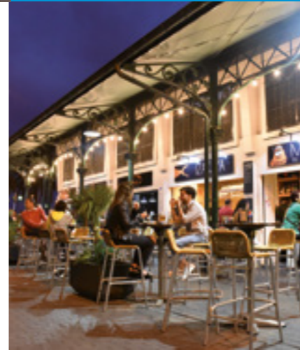
Mercado del Puerto.

The city is Gran Canaria's shopping centre. Places range from traditional markets at Vegueta, the Port and the Central Market; there are open shopping areas at Triana, Mesa y López, Santa Catalina and 7 Palmas, while the eight shopping centres in town make it the perfect place for shopping.