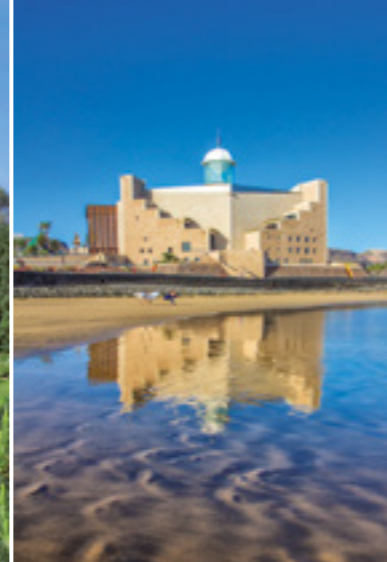
Alfred Kraus Auditorium and Congress Palace.