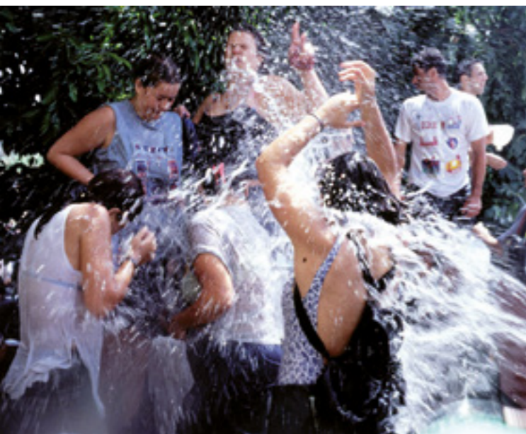
Fiesta de La Traída del Agua.