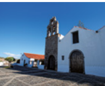
Artistic Historic District of San Francisco.

out of corn cob paste, as well as the 16 th century Gothic Flemish Alterpiece .