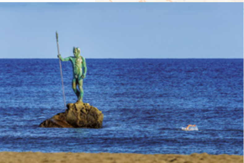
El Neptuno, Melenara Beach.