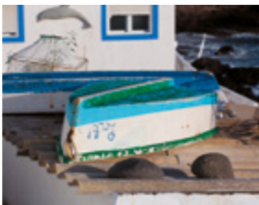
Barcas en Tufia.

We then move on to the town's founder site of San Juan , the present day administrative and judicial centre in the municipality. This borough with its stately town houses makes our stroll a highly gratifying one thanks to the wealth and variety of the architecture of the houses and other buildings on show, that combine a simple Mudejar style together with the other styles. We propose you spend just a little time at the Alameda and Basilica of San Juan Bautista , where you will find a wide variety of works of art, namely the Santísimo Cristo de Telde on the main altar, originally from Mexico and made